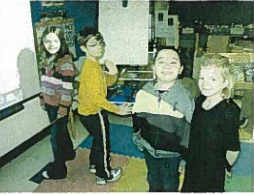
Grade 2s at the SmartBoard