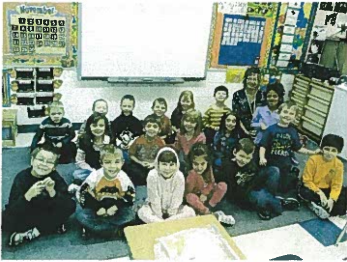
Grade 1s are all smiles