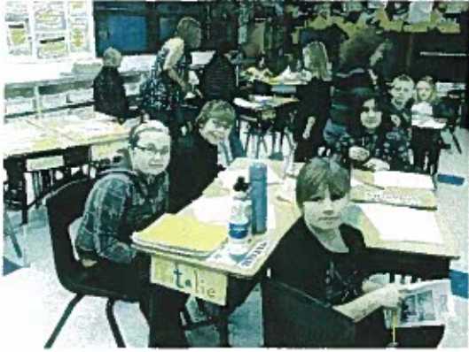
Grade 3/4 hard at work