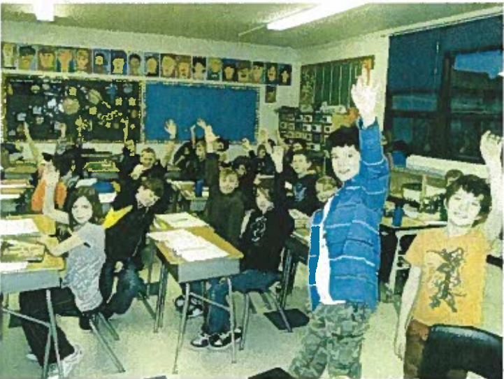
Grade 4/5 are an enthusiastic bunch